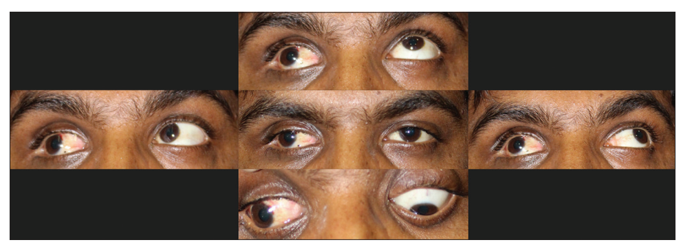
Figure 1: External photograph in the primary and secondary gaze showing right eye deviated laterally and enophthalmos with restriction of extraocular movements in all gazes.

Pre-operative imaging can help detect anatomical variations, namely, inherent deficiency of the medial wall, and surgical approach planned accordingly. Documentation of any